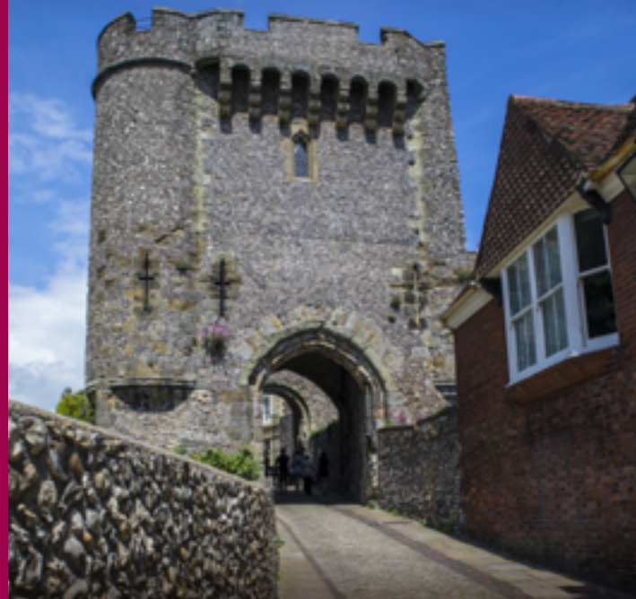
Bringing the history of Sussex to life